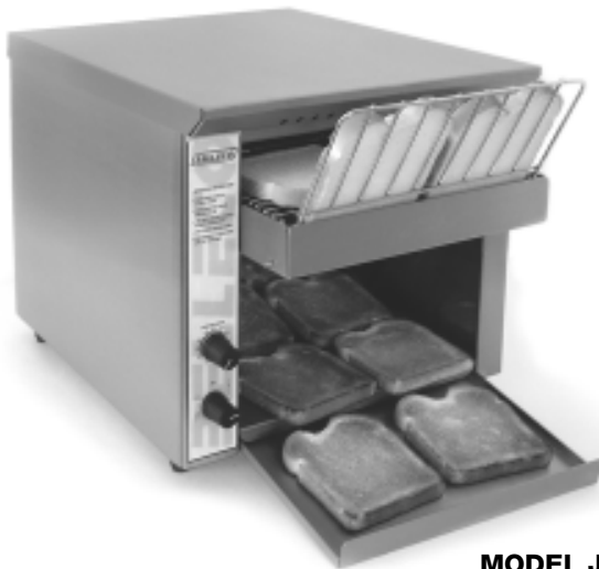
MODEL JT1 SHOWN