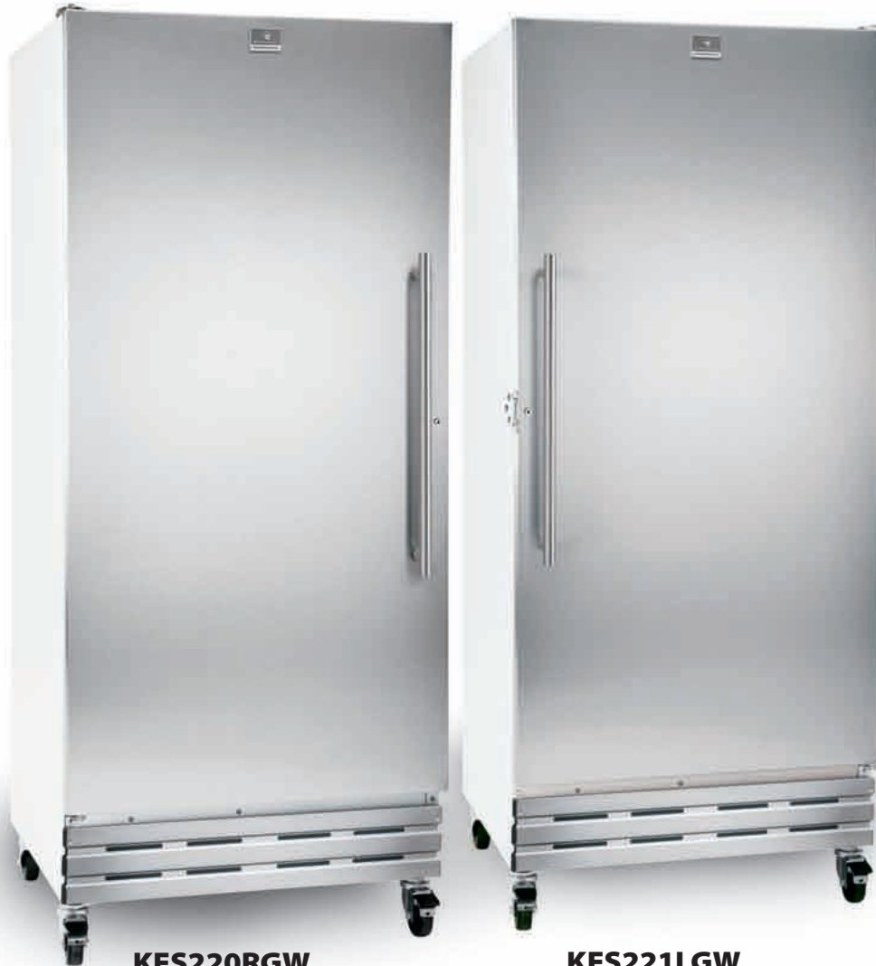
KFS220RGW 21.8 Cu. Ft. Gross Capacity Left-hand door swing only.