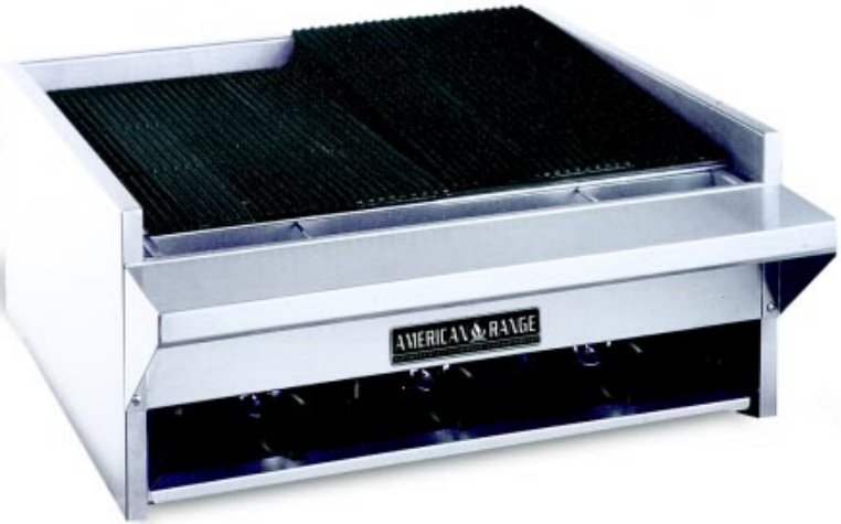
SHOWN WITH OPTIONAL STAINLESS STEEL LANDING LEDGE

All our quality counter appliances come standard with a stainless steel exterior and the best warranty in the business. Look to American Range for innovation, reliable performance, quality and attention to your equipment needs and delivery, now and in the future.